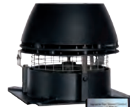
FSC variable Fan Speed Control comes standard with the fan.