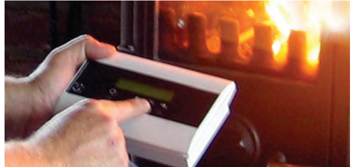
ENERVEX offers a variety of controls for easy operation. Ask your dealer which works best for your fireplace