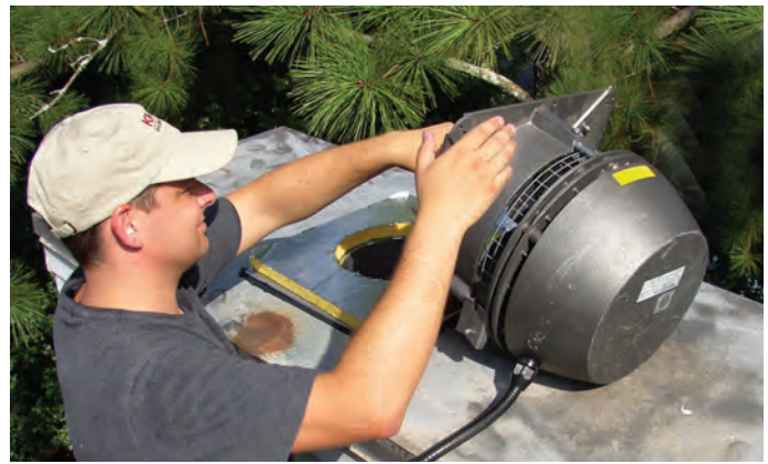
Installing the fan on top of the chimney is fast and easy.